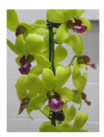
HYBRID: Owner Unknown – Please advise?